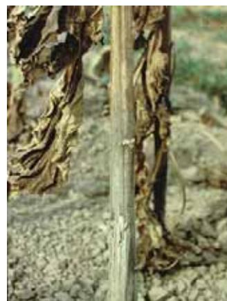
Photo 59. Charcoal rot.