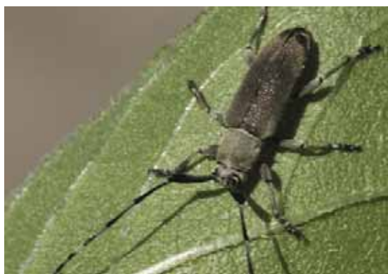
Photo 45. Dectes longhorned borer.