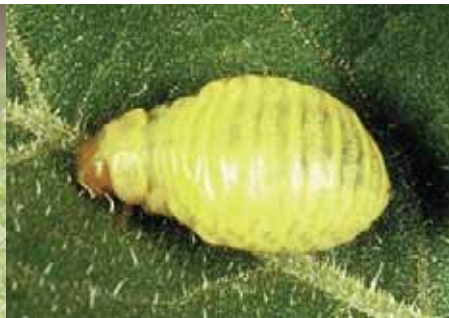
Photo 27. Sunflower beetle larva.