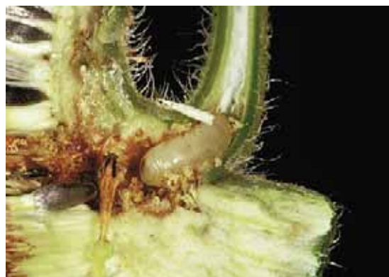
Photo 41. Sunflower receptacle maggot larva.