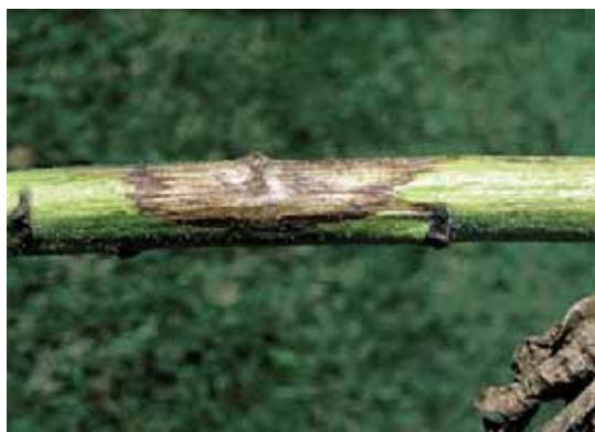
Photo 58. Phomopsis stem canker.