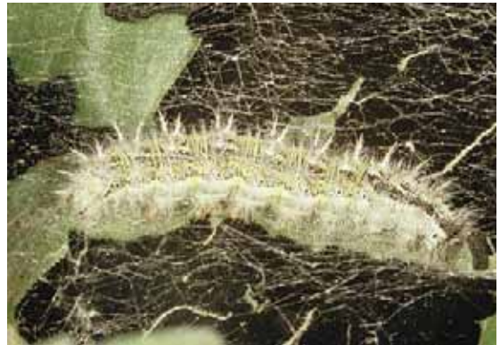
Photo 25. Painted lady larva.