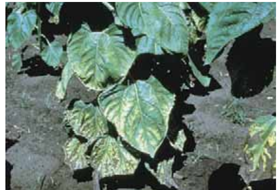
Photo 55. Verticillium wilt leaf symptoms.