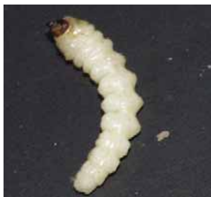
Photo 46. Dectes longhorned borer larva.