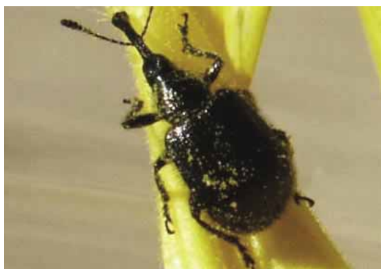
Photo 38. Headclipping weevil.