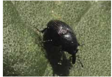
Photo 51. Sunflower root weevil.