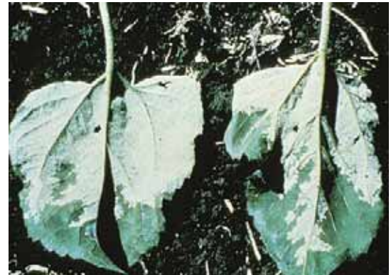
Photo 53. Downy mildew.