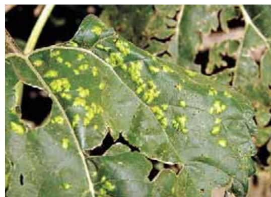
Photo 65. White rust.