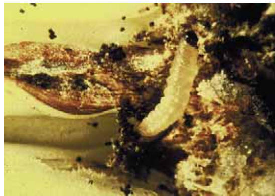
Photo 32. Banded sunflower moth larva.