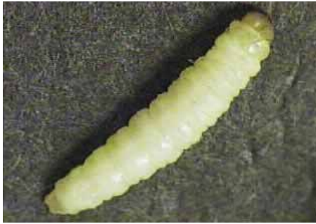
Photo 50. Sunflower root moth larva.