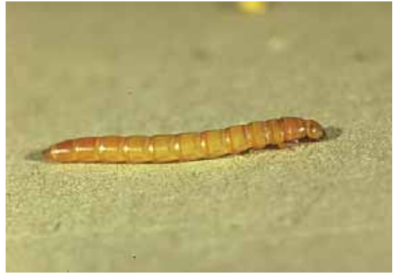
Photo 23. Wireworm.