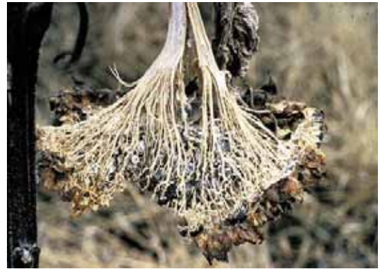
Photo 69. White mold.