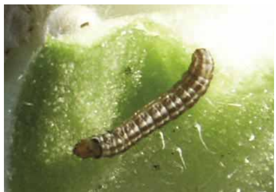
Photo 30. Sunflower moth larva.