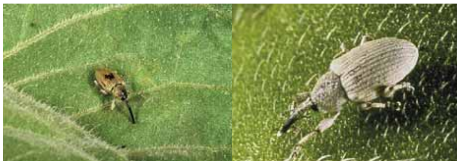
Photo 33. Adult red sunflower seed weevil.