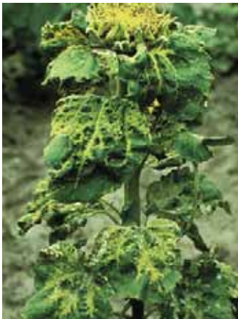
Photo 54. Downy mildew.