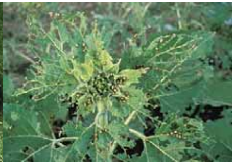
Photo 28. Adult sunflower beetles defoliating a seedling sunflower.