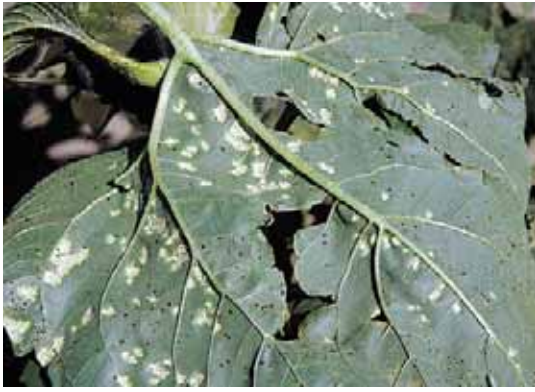
Photo 66. White rust.