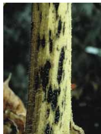
Photo 63. Alternaria.