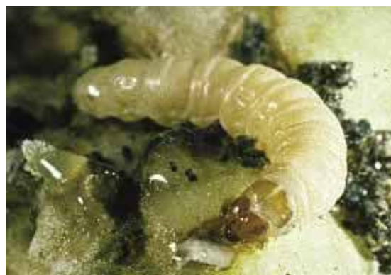
Photo 37. Sunflower bud moth larva.