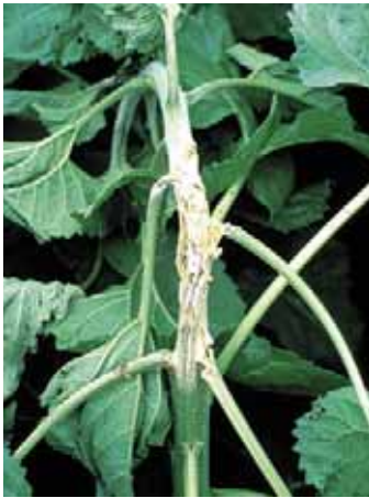
Photo 68. White mold.