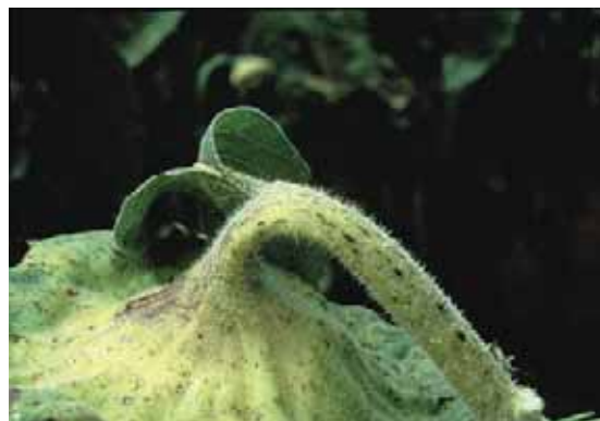
Photo 61. Alternaria.