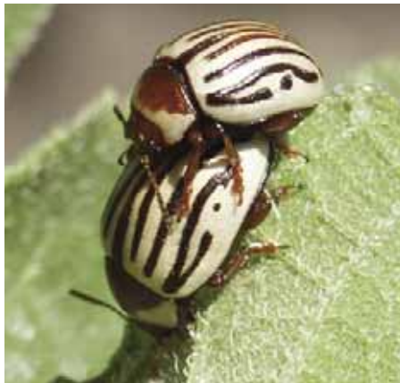
Photo 26. Sunflower beetles.