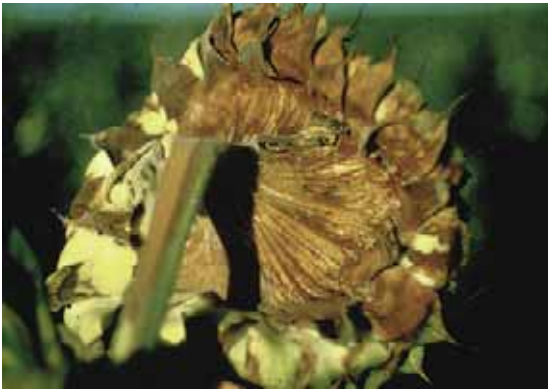
Photo 70. Rhizopus head rot.