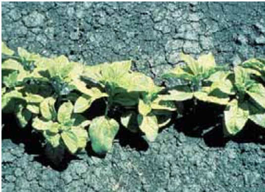
Photo 52. Downy mildew.