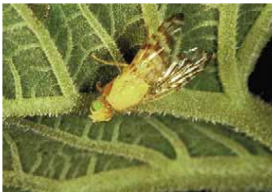
Photo 40. Adult sunflower receptacle maggot.

(see pages 21 through 22 for descriptions)