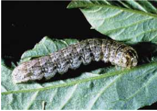
Photo 22. Darksided cutworm.