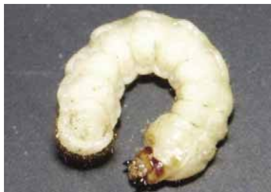
Photo 49. Ataxia longhorned borer larva.