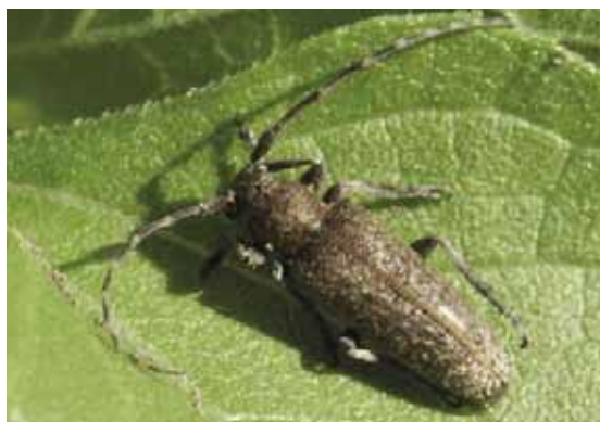
Photo 48. Ataxia longhorned borer.