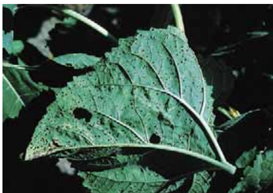
Photo 64. Red rust.