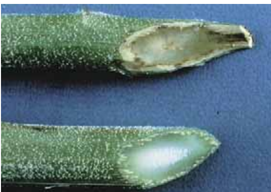
Photo 56. Verticillium wilt stem symptoms.