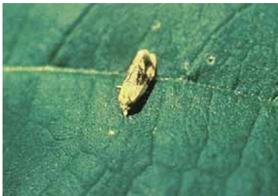
Photo 31. Banded sunflower moth.

(see pages 19 through 21 for descriptions)