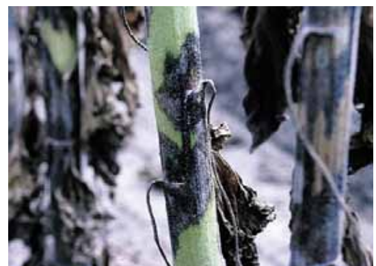
Photo 57. Phoma black stem.