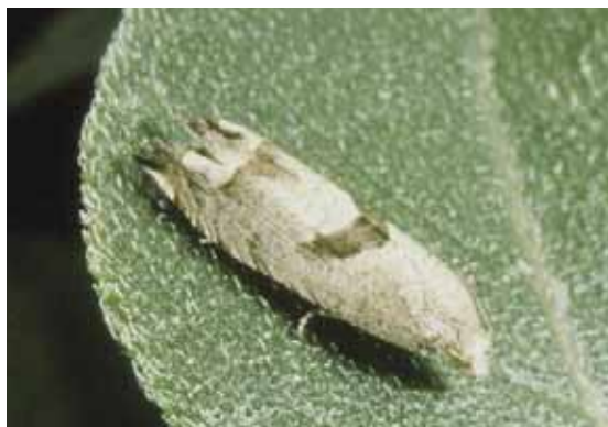
Photo 36. Adult sunflower bud moth.