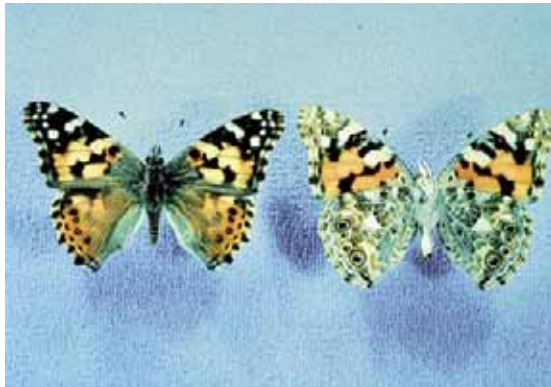
Photo 24. Painted lady butterfly.