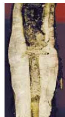
Photo 47. Overwintering chamber of Dectes longhorned borer.