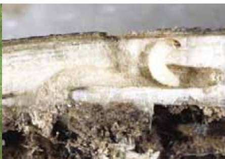
Photo 43. Sunflower stem weevil larva.