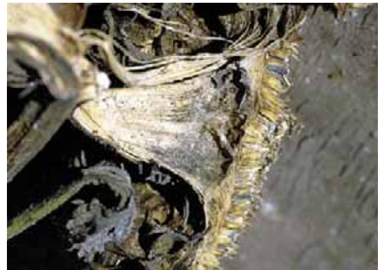
Photo 71. Rhizopus head rot.

Brand names appearing in this publication are for product identification purposes only. No endorsement is intended, nor is criticism implied of similar products not mentioned. Persons using such products assume responsibility for their use in accordance with current label directions of the manufacturer.