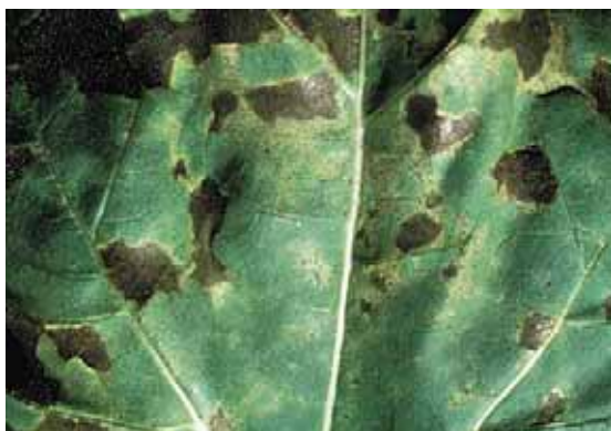
Photo 62. Alternaria.