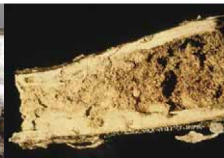
Photo 44. Overwintering galleries of sunflower stem weevil larva.