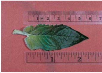
True leaf — 4 cm