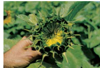
R-4 Top View