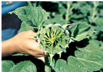
R-3 Top View